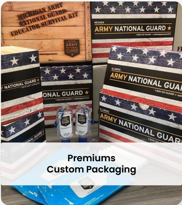
Premiums Custom Packaging