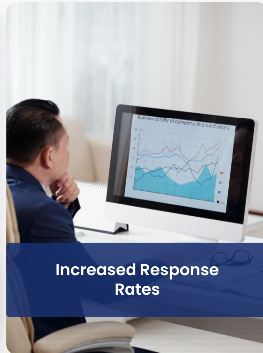
Increased Response Rates