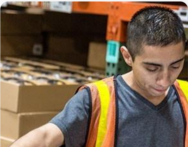
Complex Hand Assembly Pick & Pack