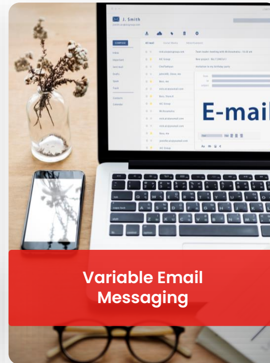
Variable Email Messaging