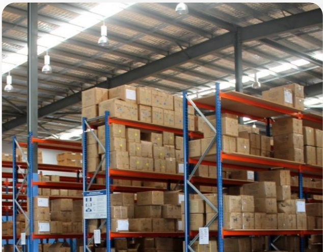
Kitting Inventory Management Warehouse Storage